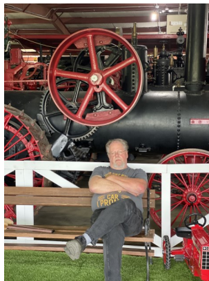
Big wheel blowing off steam at the Stuhr Museum!