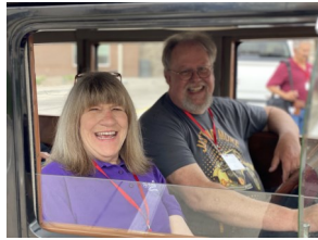
Our windows actually work!