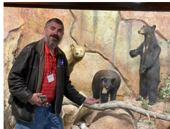
We told you— Don't Feed the Bears!