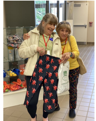
Kool-Aid jammies are Kool!