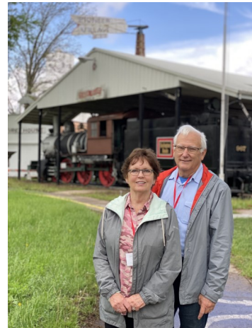
Training at Pioneer Village!