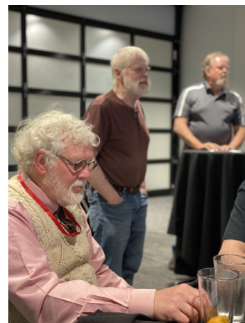
The Brain Trust at Work!