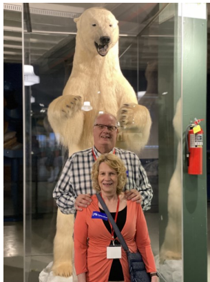
Don't look behind you at the Hastings Museum!