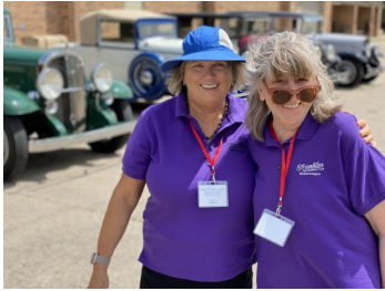
Purple People Eaters