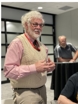
The Physics and Franklins equation explained.