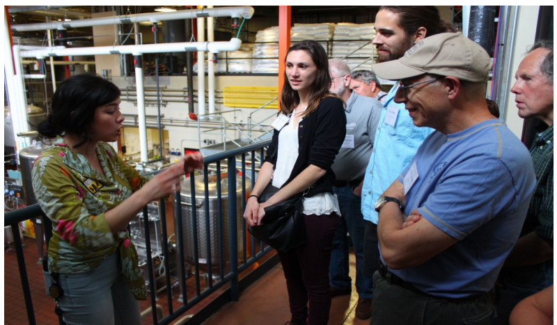
Bell's Cornstock Brewery