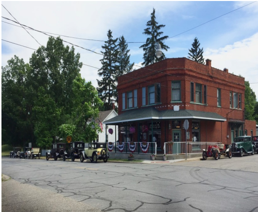
Scotts Corner Café and Franklins