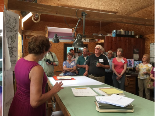
Full Spectrum Stained Glass