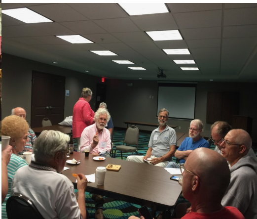
Hospitality Room at Holiday Inn Express