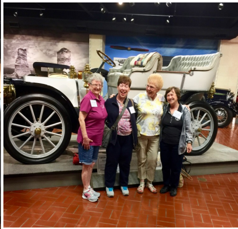
"Fab (Midwest) Franklin Four"