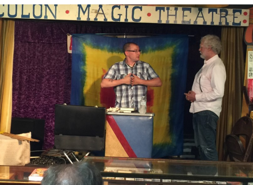
Happy Magic Man and Bouvard