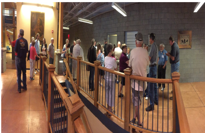
Bell's Comstock Brewery - Waiting in line for a taste.