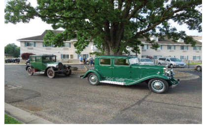
Rounding up Franklins for the tour