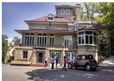
Wonderful Maywood Mansion