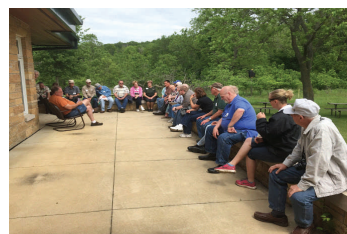
Making "Bid Decisions" Midwest Region Spring Meet