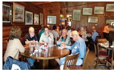
Lunch at Good Times Restaurant