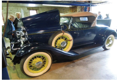
So, what is this?