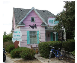
Sugar Plum House