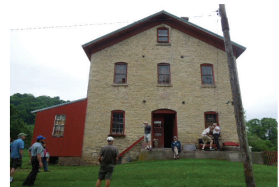
Schech's Mill built in 1876