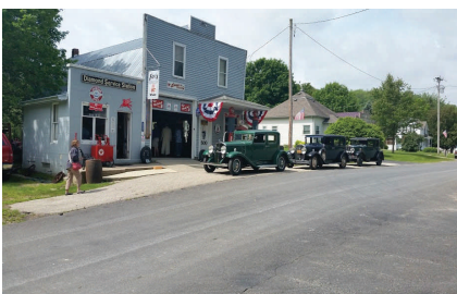
Ernie's Station in Whalan