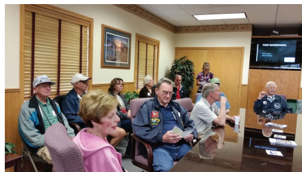
Is it true that you can make Ethanol from corn or is it soybeans?