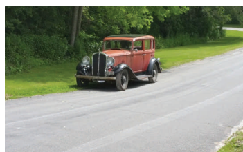
Is there a problem?