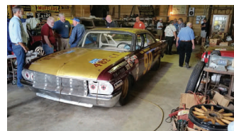
1961 Ford —Nascars fastest