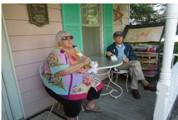
Yummy Good Ice Cream