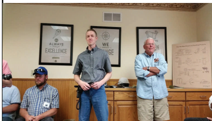
Ethanol 101—POET Ethanol Plant