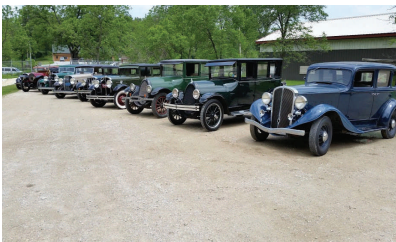
The Line-up at Lanesboro Hatchery