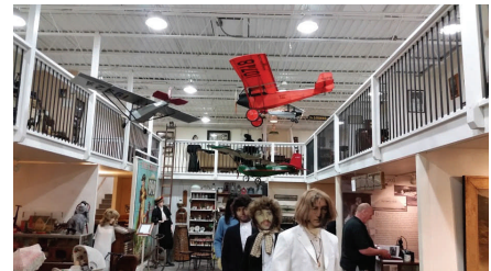
Look who we saw at the Fillmore County History Center—Yes, the BEATLES!