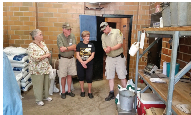
Really! Is that what those fish eat!