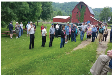
Anxiously awaiting a tour of Shech's Mill