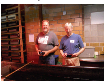
GUILTY for a Great Meet!