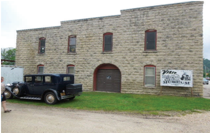
Stan Agrisome's Car Museum built In 1910