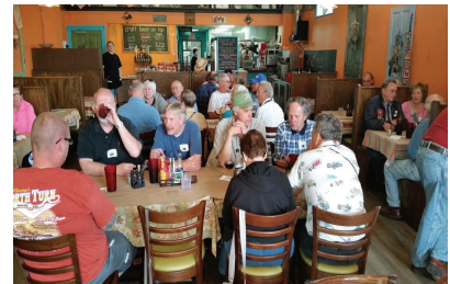
Lunch at Pedal Pushers