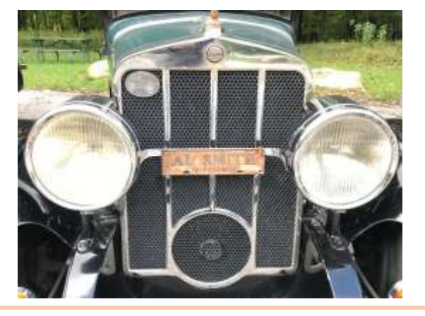
Bill Eby's license plate topper social media ca. 1928

It's been hours since we've eaten and we're STARVING!