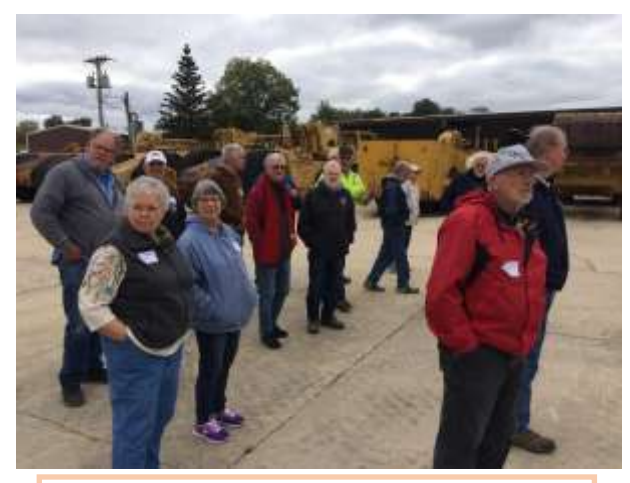
Caterpillars just look like all of this STUFF!