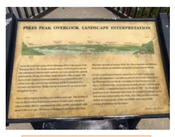
Pikes Peak signage