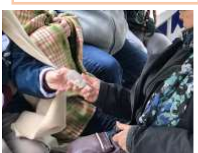
If we didn't know these were pearls, this might look kinda suspicious!